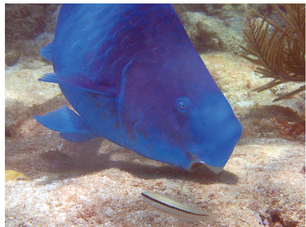
Blue parrotfish Scarus coeruleus cropping algae on a reef.

Resale or republication not permitted without written consent of the publisher