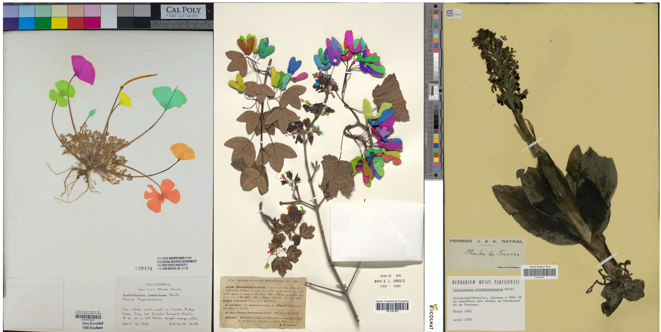
Figure 2. Examples of herbarium specimens displaying visual heterogeneity (e.g., in morphology, labels, and color standards) and challenges related to the morphology and position of reproductive structures. The specimen on the left shows large, isolated reproductive structures that would likely be annotated successfully by ML algorithms. The specimen in the center with small flowers and numerous overlapping fruits would be much more difficult for ML algorithms to parse. The specimen on the right would be very difficult for ML algorithms to delineate or count because of the unclear distinction between flowers and buds. Examples of segmentation masks (see the glossary in box 1) created to delineate reproductive structures are shown by the brightly colored areas in the left and center specimen images.

worldwide are not digitized. Continued digitization of herbarium specimens is needed, particularly of phylogenetically and morphologically diverse collections that can reflect visual variation among specimens and therefore enable the creation of more versatile training data sets.