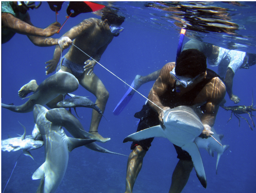
Fig. 2. Reef sharks have been severely depleted across their range, but still remain abundant in certain remote ecosystems. The residents of Tabuaeran Atoll harvest reef sharks for their meat, fins, skin, and teeth. Shark fins are one of the few sources of cash income for the members of this remote atoll.

Remote places are also, almost by definition, sub-optimally situated for the application of ecosystem services conservation. The low population densities and isolation that characterizes remote areas means that there are fewer endemic service recipients in these zones and that it may be harder to trace service provision from remote ecosystems to populated centers. Palmyra provides a good example. Researchers are currently investigating whether Palmyra, as a less-disturbed marine ecosystem, may help replenish reef biodiversity at other populated atolls in this region via larval