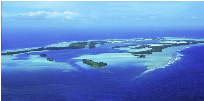
Fig. 1. Palmyra Atoll is one of the most remote sites in the United States and serves as an excellent example of how less-disturbed reef ecosystems function. Palmyra was directly purchased to conserve the biodiversity that it harbors.

The two model remote sites that we will use to illustrate our points in this discussion are Palmyra (5°52'N, 162°04'W; USA)